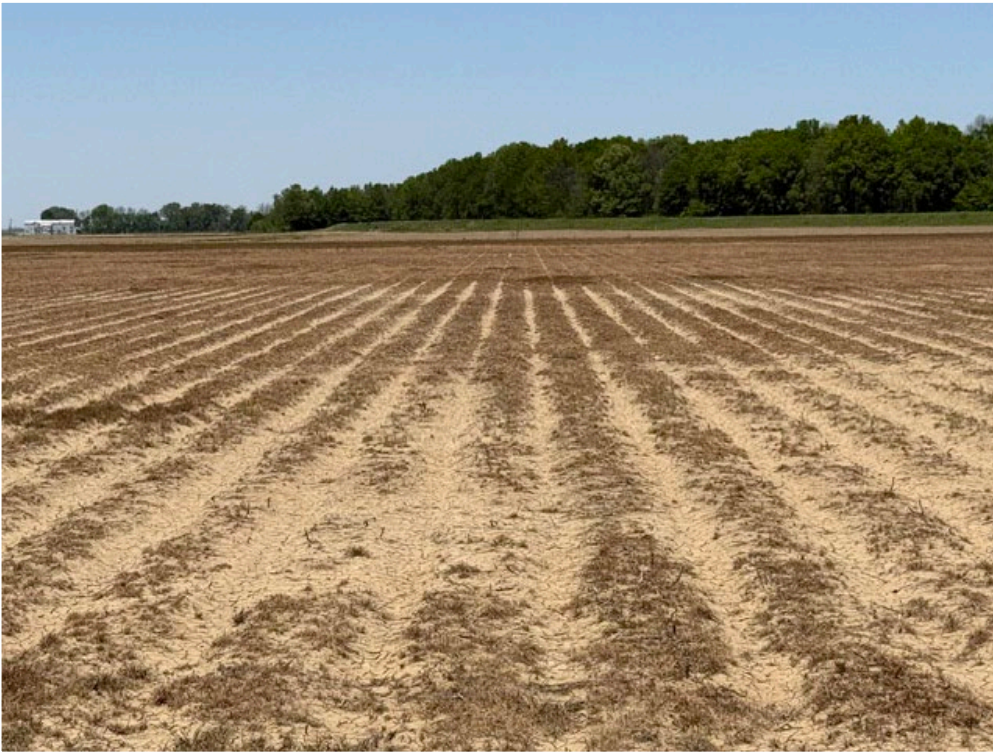
PRECISION LEVELED FIELD