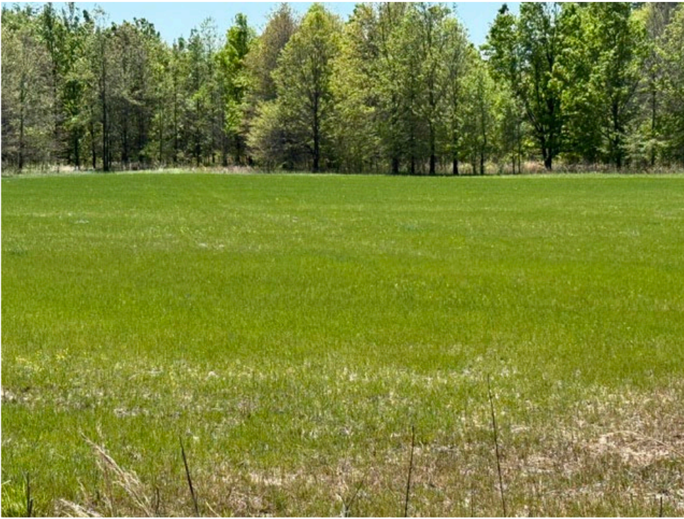
WATERFOWL FOOD PLOT