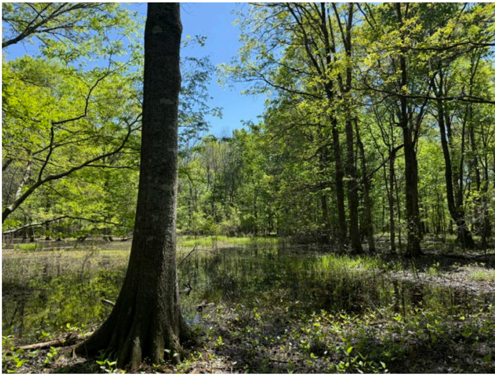
GREEN TIMBER HOLE