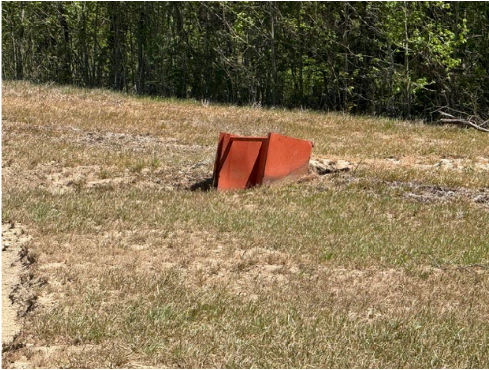
FLOOD CONTROL STRUCTURE