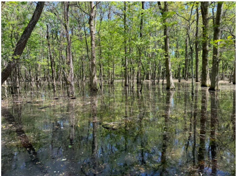
FLOODED GREEN TIMBER