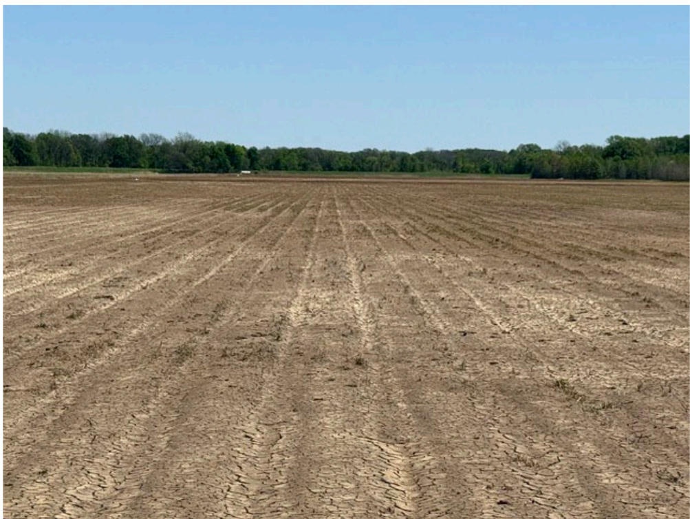
PRECISION LEVELED FIELD